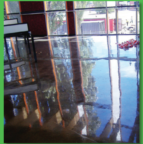
Economical clear finishes - chemical - epoxy - urethane