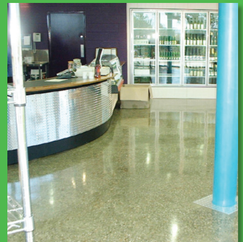
Deep grind - hone and urethane seal