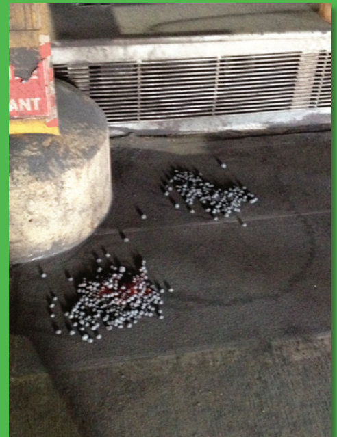
Minerals processing. 600°c pellet spillage on floor, no damage.

WE OFFER EXPERIENCE, INNOVATION, QUALITY, SERVICE