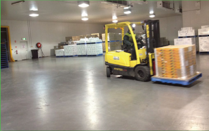
Heavy duty screed for 900m 2 distribution centre and a weekend to install