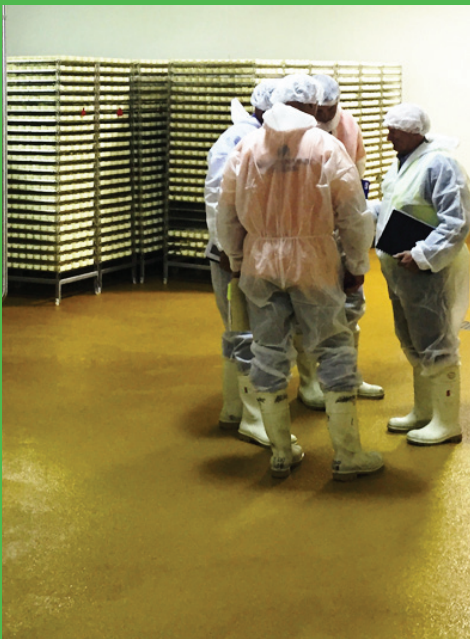
Cheese production - reviewing a floor after 12 years intensive service - looks great