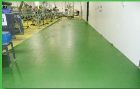
Beverage production, meat processing