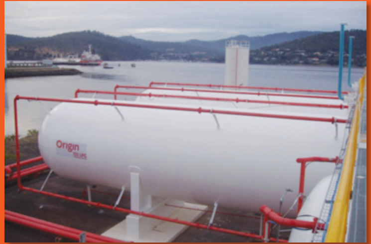
After concrete and steel remediation