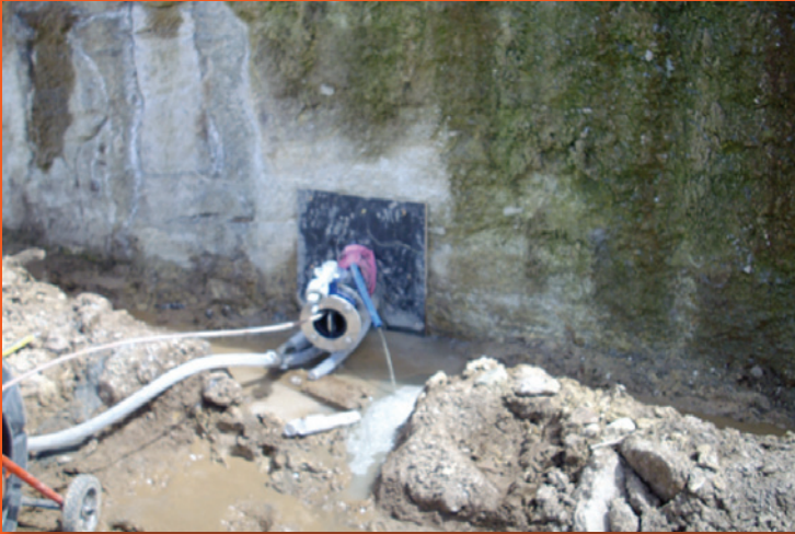
NYRSTAR – 200 metre holes drilled into embankment required the final 20mtrs to have stainless steel pipe and flange termination grouted in place – Special purpose grouting technology was developed to undertake the works – Picture shows grout being placed with overflow bleed in action.