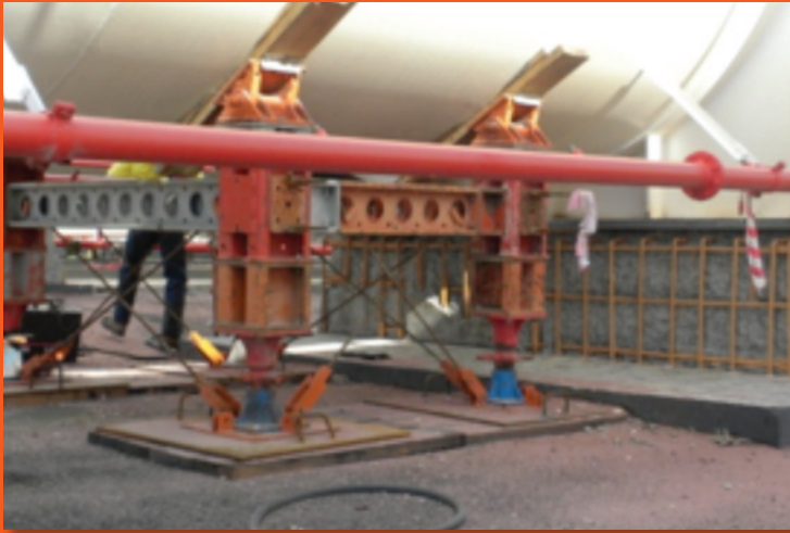
Extensive Concrete Repair