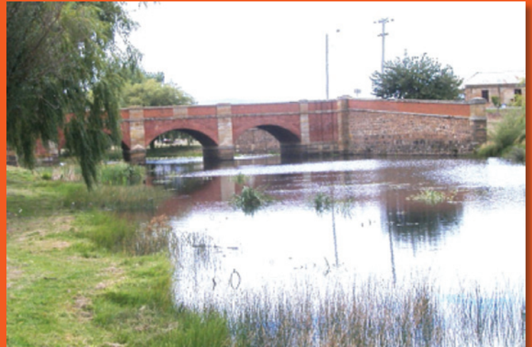
Red Bridge Campbell Town – Archtec anchoring to upgrade load capacity of this major highway historic bridge – Completely hidden – this bridge has 36 x 5mtr stainless steel anchors placed tangentially to the 3 arches.