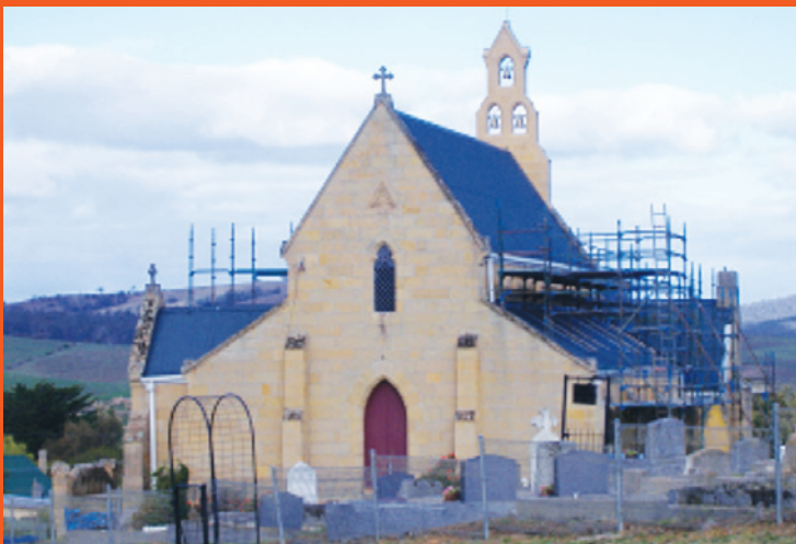
St Patrick's Church at Colebrook – Restoration for Pugin Foundation. Cintec – fully hidden stainless steel anchors support and tie the spire structure and main roof.