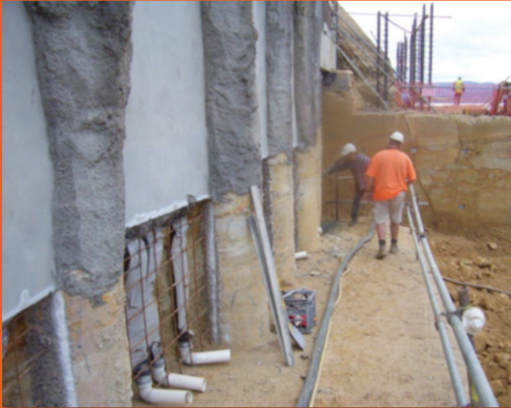
MONA – Shotcrete – preparation and application.