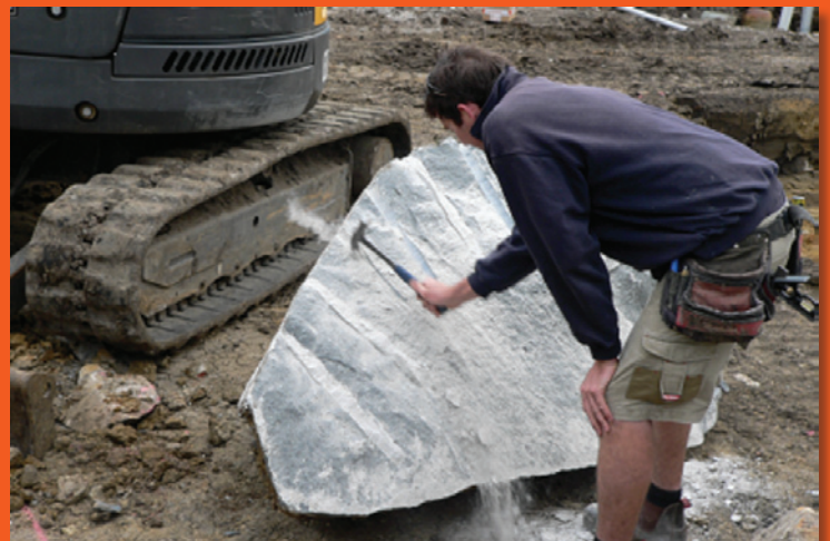
Demolition grout – great for breaking out dolerite rock – silently – in built up areas – where blasting is not acceptable.