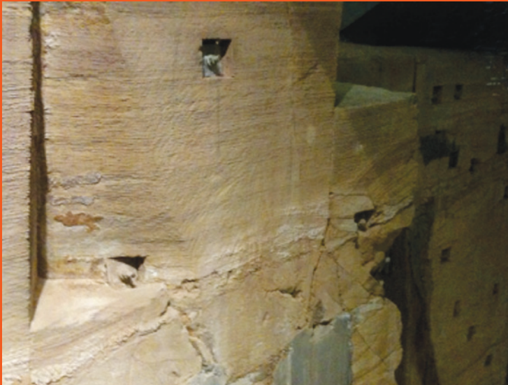
Museum of Old and New Art – Feature wall incorporating rock bolting.