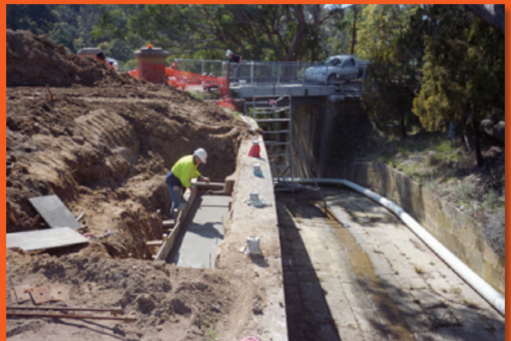
Hobart Reservoir – Cintec anchors to full height to stabilise wall for 1000 year flood security – This is a heritage site and all anchoring is completely hidden.