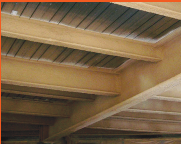
Vermiculite firespray to steel beams providing 120 minute rating to structural steel members.