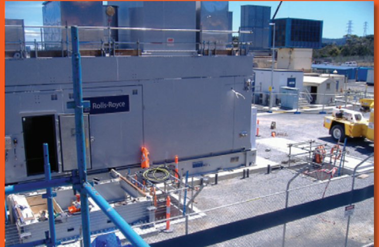
BELL BAY GAS FIRED POWER STATION – The Rolls Royce, turbine and generator set is the main power plant and sits on a tapered grout bed 80 to 30mm over 30mtrs – 6m 3 epoxy deep pour grout placed within 1 day – Continuous pour mixing and pumping technology.