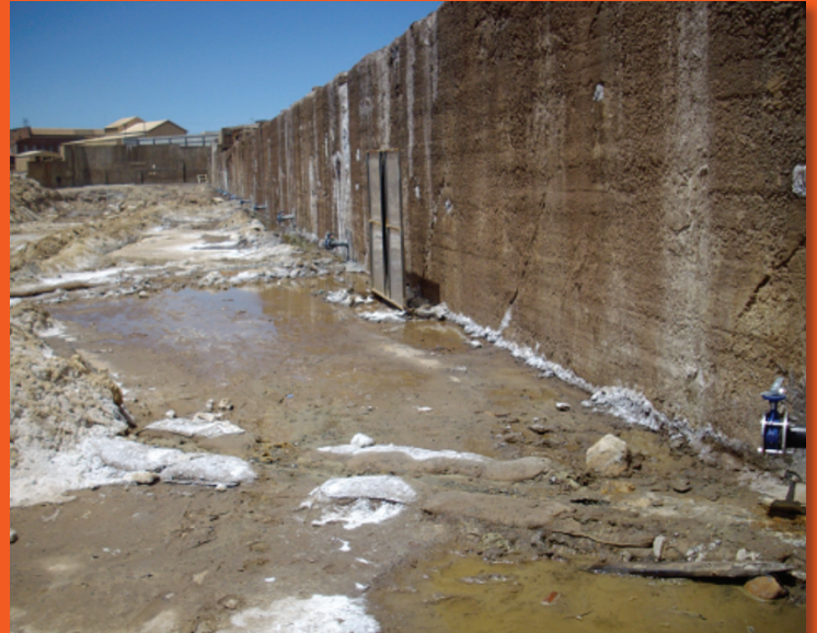
NYRSTAR – The completed system – 9 outlets – Acids can now be drained out as required and be removed safely.