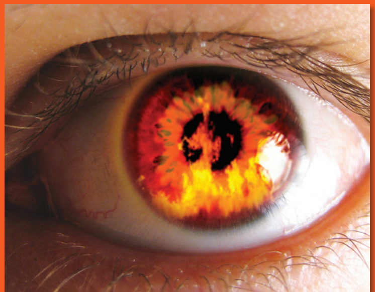
Looking for fire protection? We offer a comprehensive range of solutions.