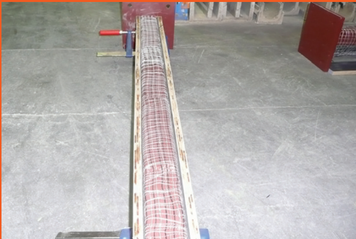
6hr fire rated encasement of SHS steel – preparation stage.