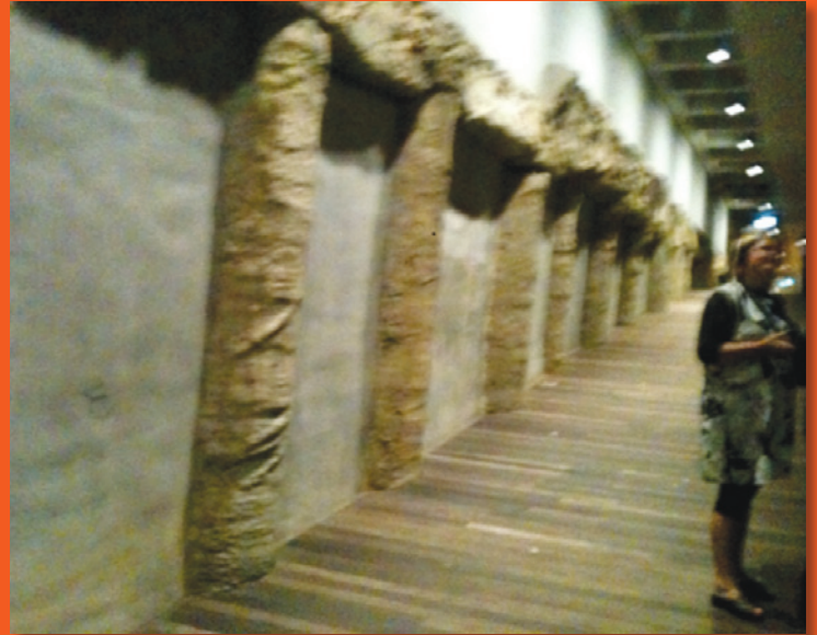
MONA – feature wall – The shotcrete application completed.