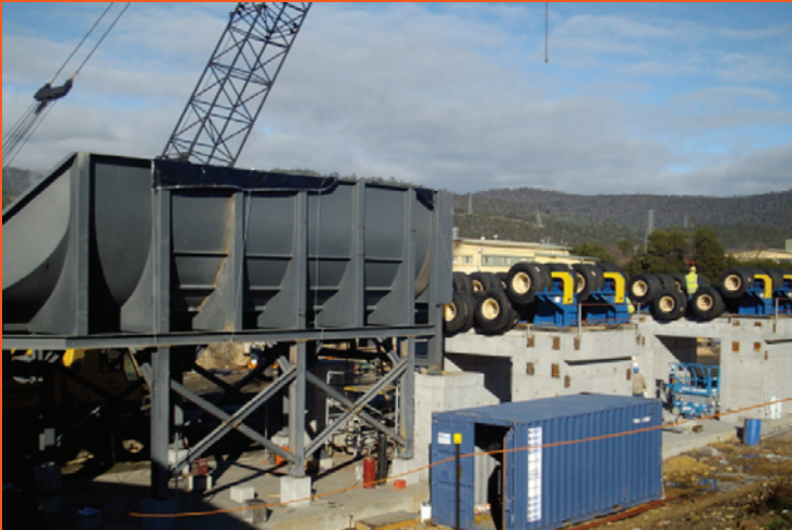
NORSKE SKOG – 11 cubic meters of deep pour epoxy grout placement to log feed and debarking mill base plates – This specialised grout for high dynamic loads placed using continuous mixing and pumping technology.