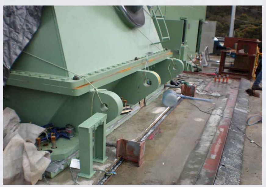
Cementitious Grouting to Mitsubishi Steam Turbines These machines were on elevated platforms making access difficult and pumping necessary.