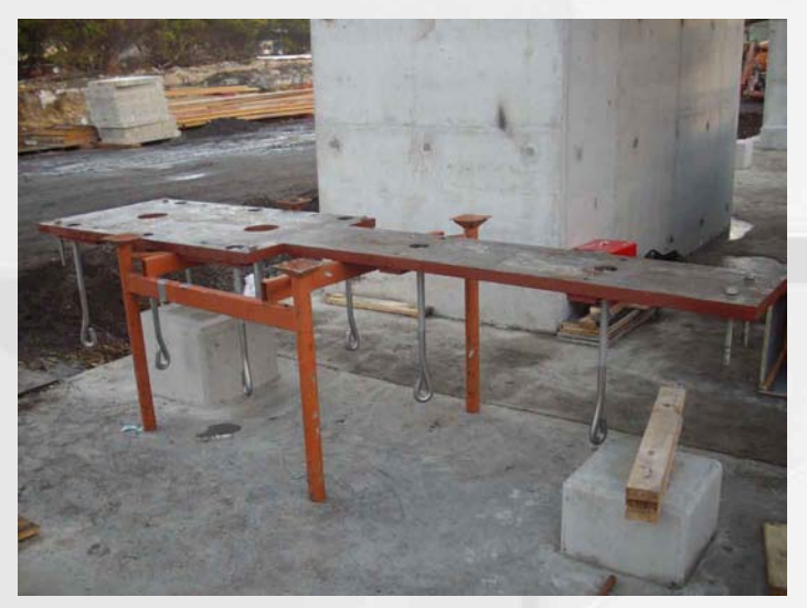
BASE PLATES WITH ANCHOR BOLTS & SHIMS READY FOR PLACEMENT