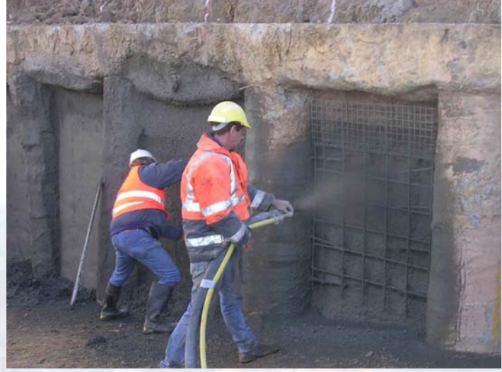
Placement & Cut back to form required Profile