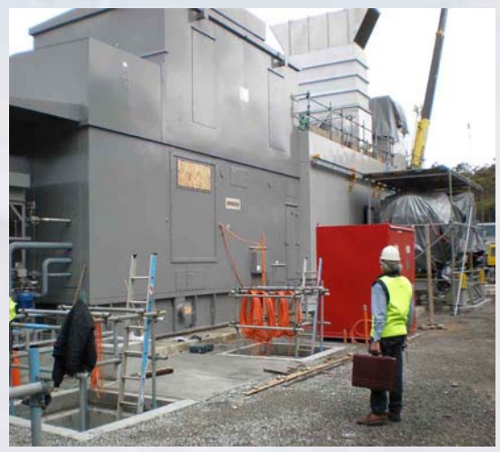
Project completed and a sigh of relief at the huge Epoxy Placement in a short time frame