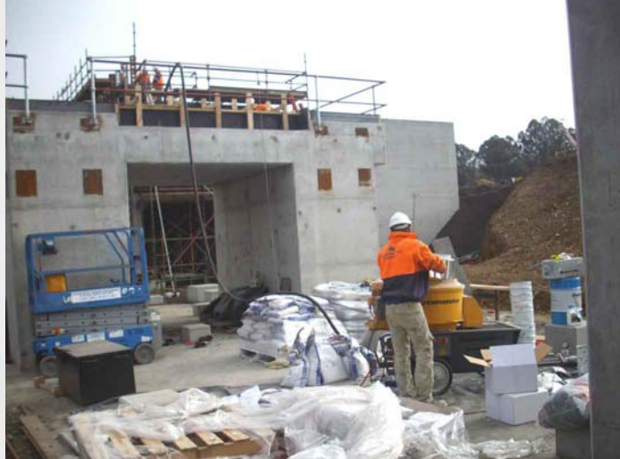
OUR INVESTMENT IN PURPOSE BUILT MIXING AND PLACING EQUIPMENT MET THE CHALLENGE