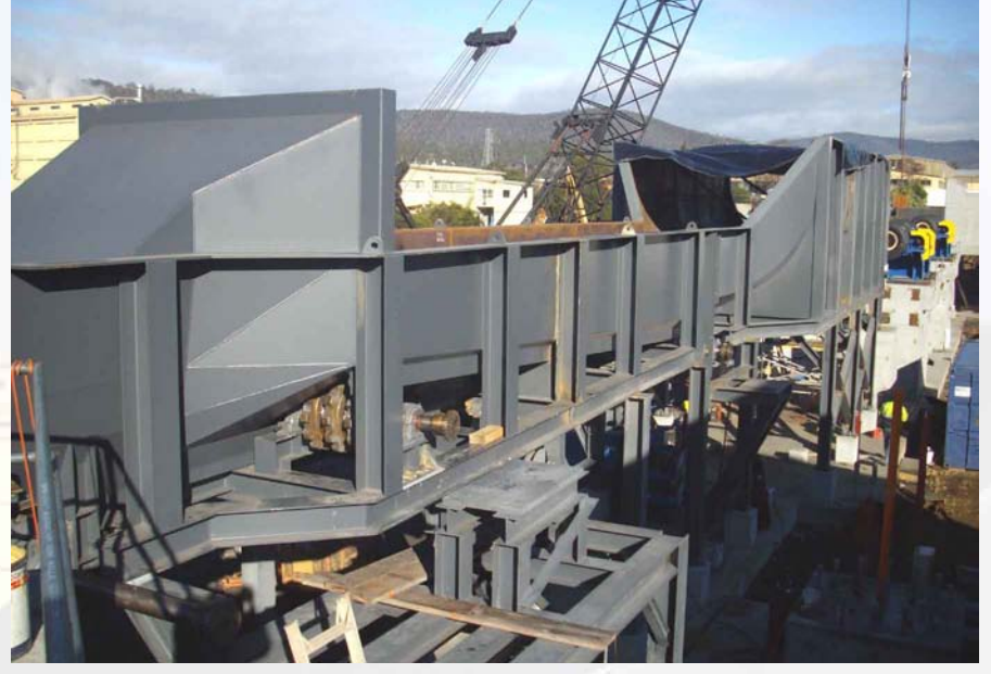
Installation by high volume Mixer & Pump system of bulk Epoxy to debarker & Chipper Bases