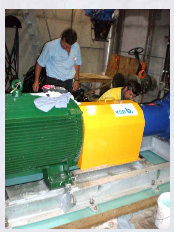
Inspection of Epoxy Grout after placement under new waste water pump, Hobart