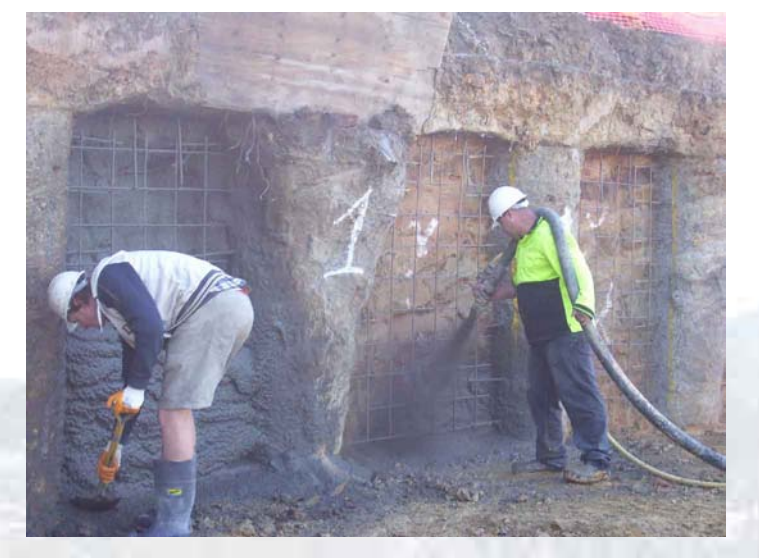
Initial placement of shotcrete over reinforcement steel

Earth stabilisation by utilising reinforced sprayed shotcrete with steel trowel finish