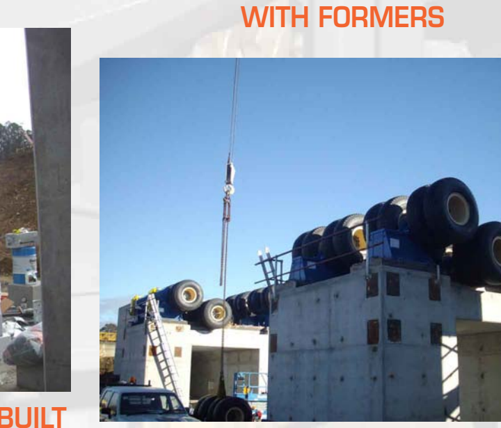
DEBARKING DRUM BOGIES IN POSITION AFTER EPOXY GROUTING