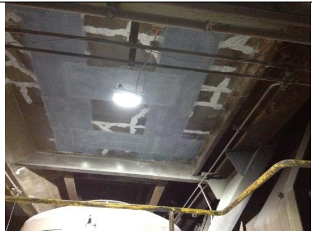
Severely cracked suspended floor, repaired and stitched using unidirectional carbon fibre