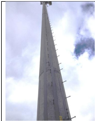
Monopoles reinforced with carbon laminate to reinforce against increased windage resulting from new NBN equipment