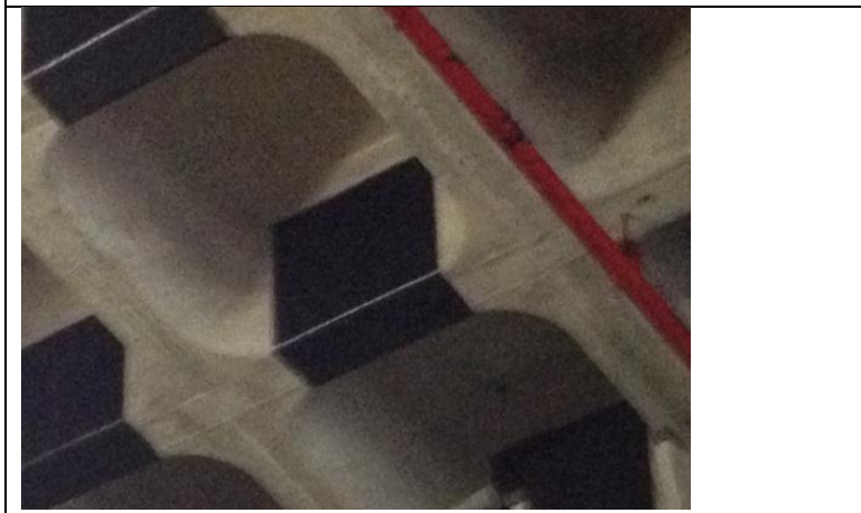
Waffle pod soffit to suspended floor. Shear stress capacity increase with unidirectional carbon fabric