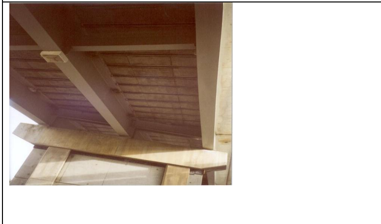
Bridge soffit -upgrade of capacity with carbon fibre laminate