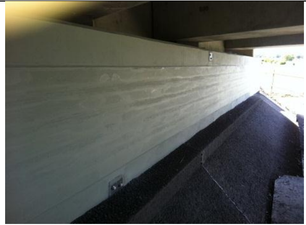
Bridge abutment concrete repair, crack repair followed by 5 x double layer of carbon laminate and UV membrane over