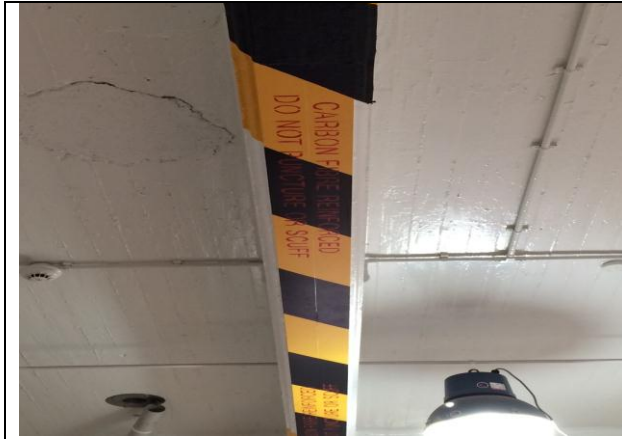
Structural beam reinforcing to upgrade load capacity of suspended slab