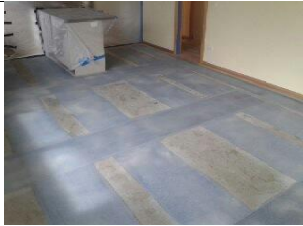
Domestic slab was understrength and was over a rock. The slab was cracking due to hogging. Cracks repaired and slab substantially reinforced against hogging stress with unidirectional carbon fibre fabric