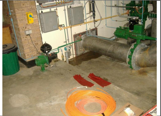
Sand filtration plant filter bed support structure reinforced with laminate and fabric – very confined space work

Maintenance Systems Pty Ltd has in place: