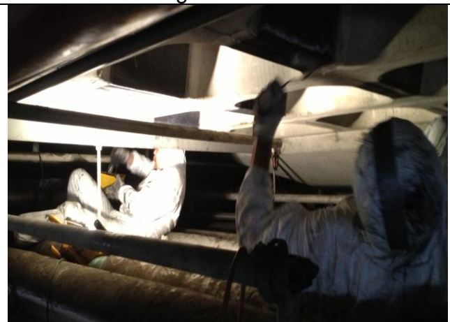
Very cramped working, and there was a lot of it.