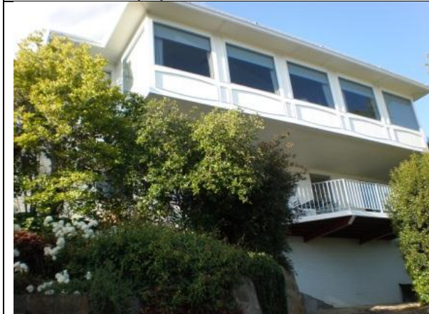
Cantilever balcony capacity and stiffness upgrade with carbon laminate