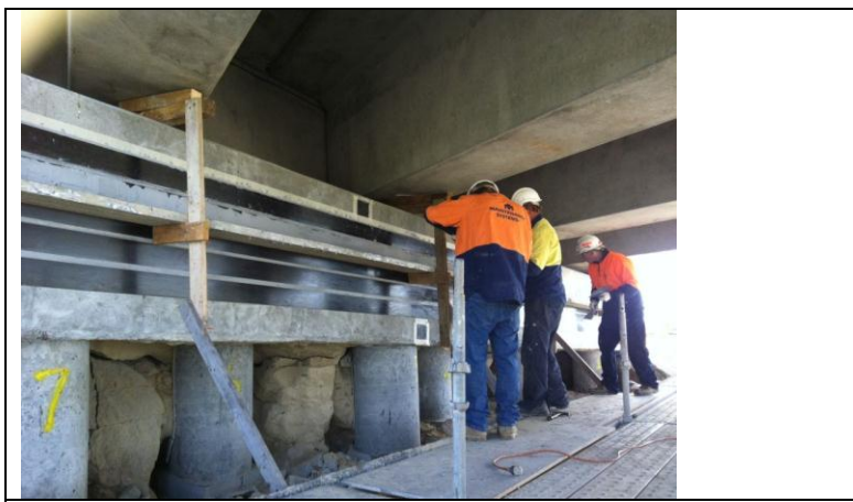
Bridge abutment repair and strengthening- Placing the carbon laminate