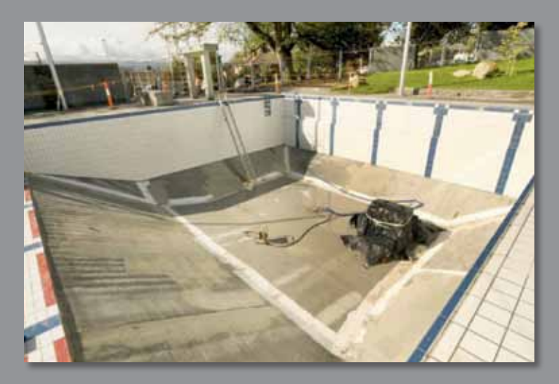
Leak sealing from the positive side – systems include injected expanding urethanes, epoxy injection, Crystal growth cementitious (Xypex)