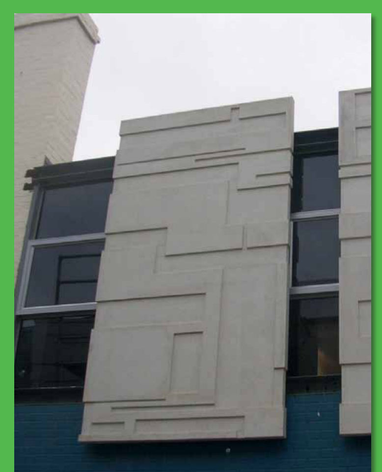
Clear silane providing waterproofing, chlorides and carbonation protection to concrete