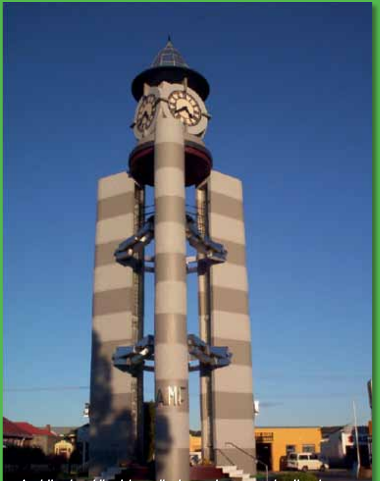
Architectural liquid applied membrane protection to Ulverstone Memorial clock tower