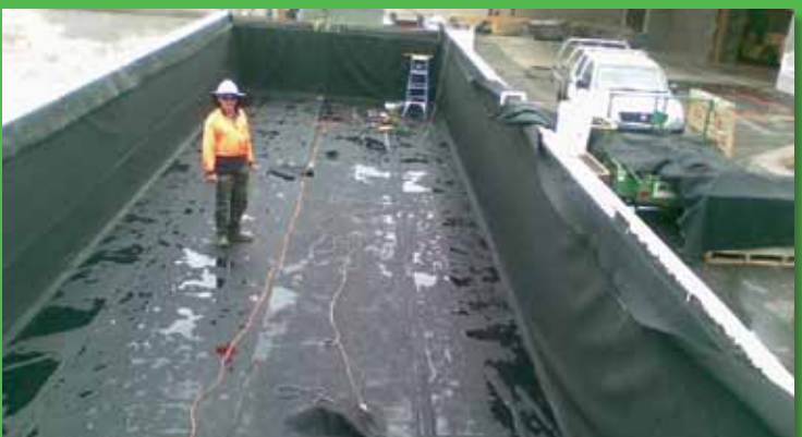
Tank lining – Butynol welded sheet membrane – Rio Tinto cooling ponds