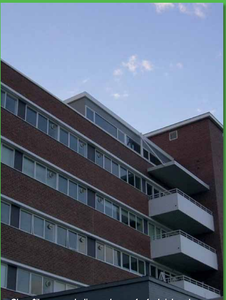
Clear Silane penetrating waterproofer for brickwork