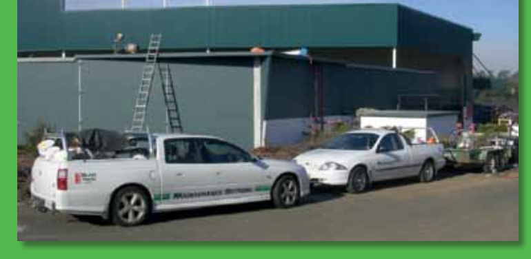
Water storage tank for fire system, Marliflex, Instant set, Plural Bituminous seamless membrane lined