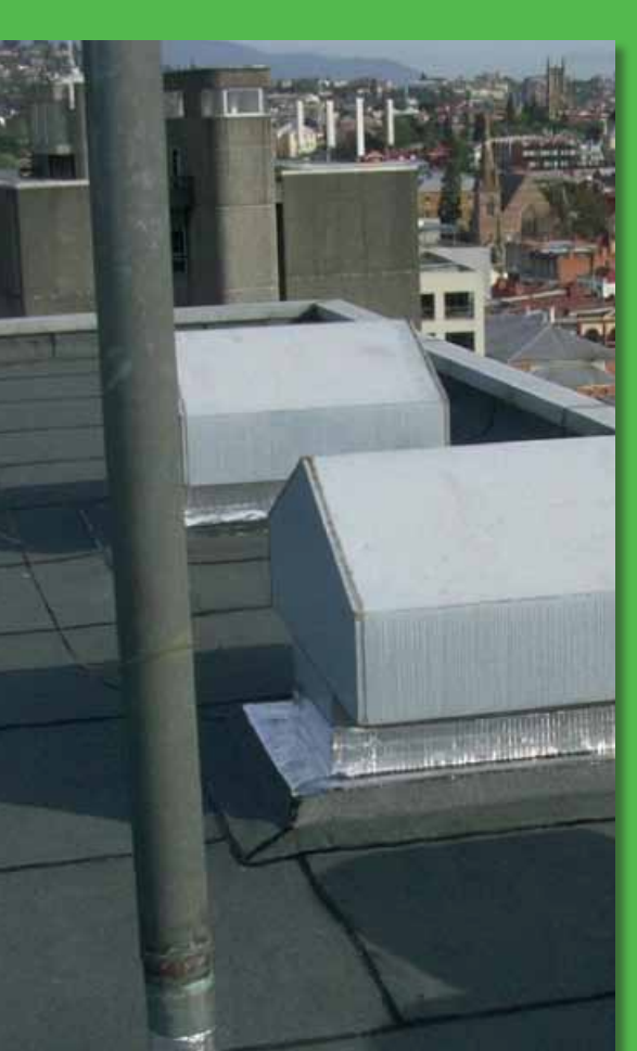
Mineral Finish 4mm thick torchdown roof, UV stable and light trafficable