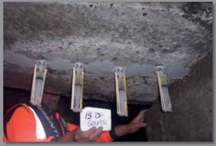
Crack injection of epoxy reconsolidate concrete substrate before applying membranes or coatings