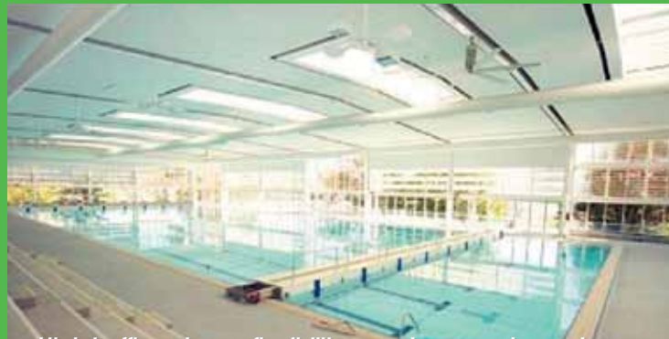
High traffic extreme flexibility seamless membrane to colour and slip resistance of choice protecting the plant rooms under – Launceston Aquatic Centre